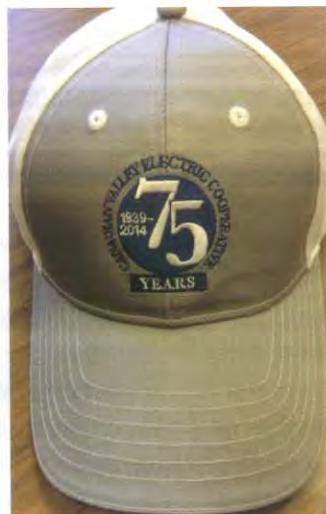
CVEC 75th Anniversary cap

The order of business shall be as follows: